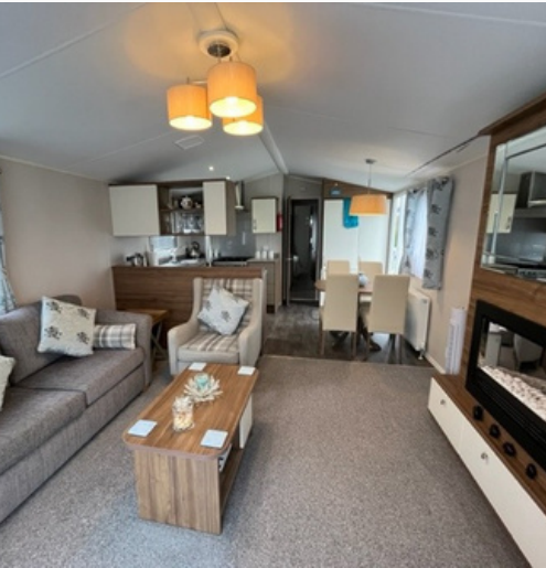
Bright and modern lounge