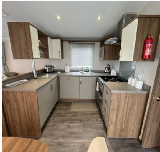
Well designed kitchen layout